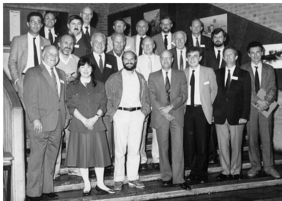
Fig. 3. Participants at the inaugural meeting in Canterbury in 1987